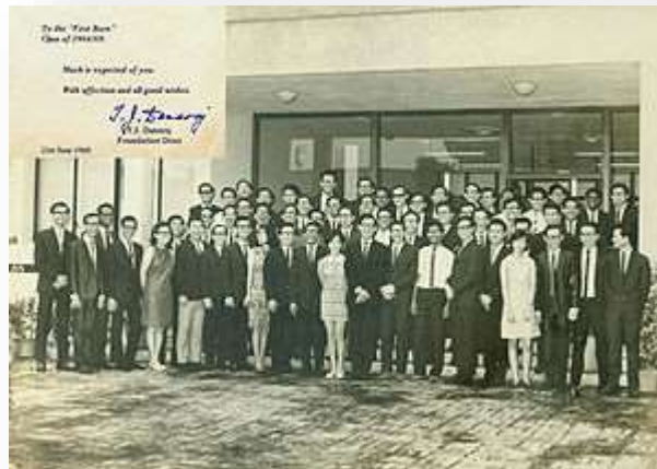
FIRST BATCH- 1969